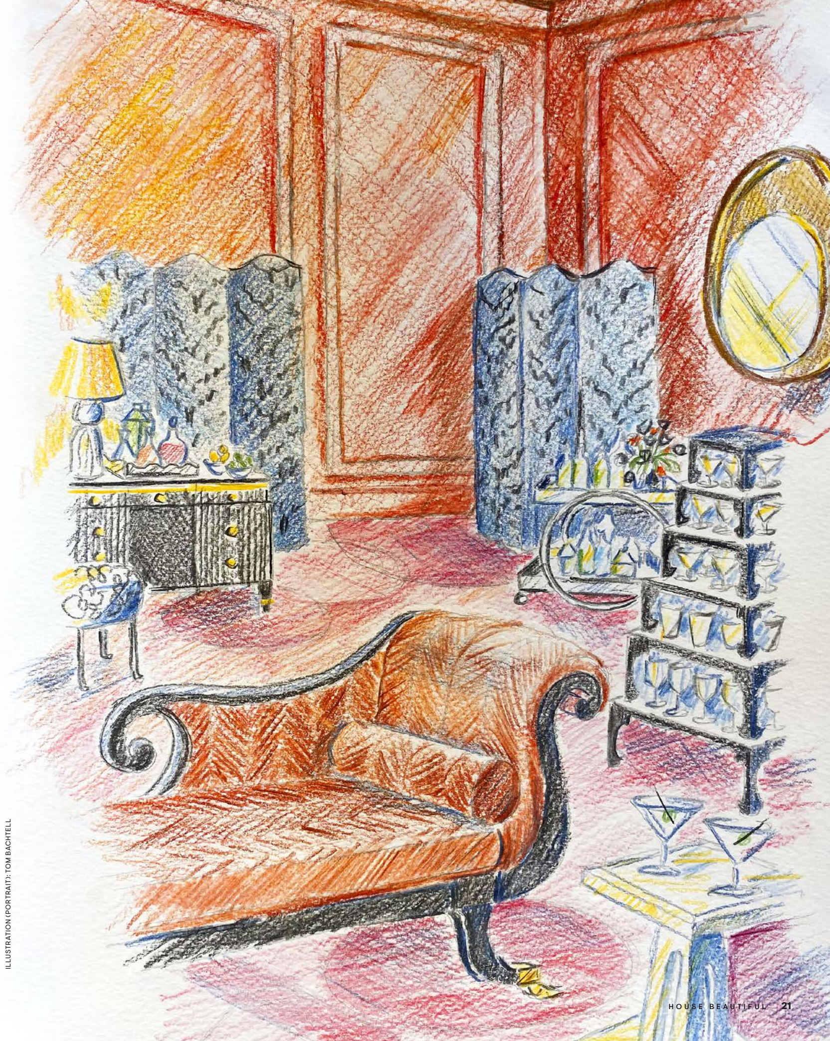
ILLUSTRATION (PORTRAIT): TOM BACHTELL